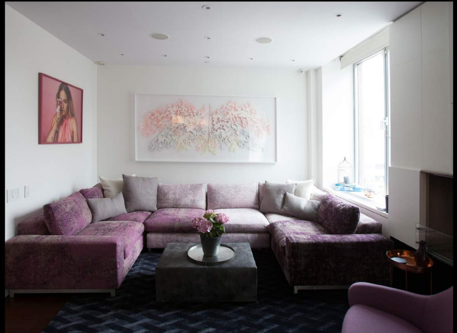
Public Spaces Coffee Area